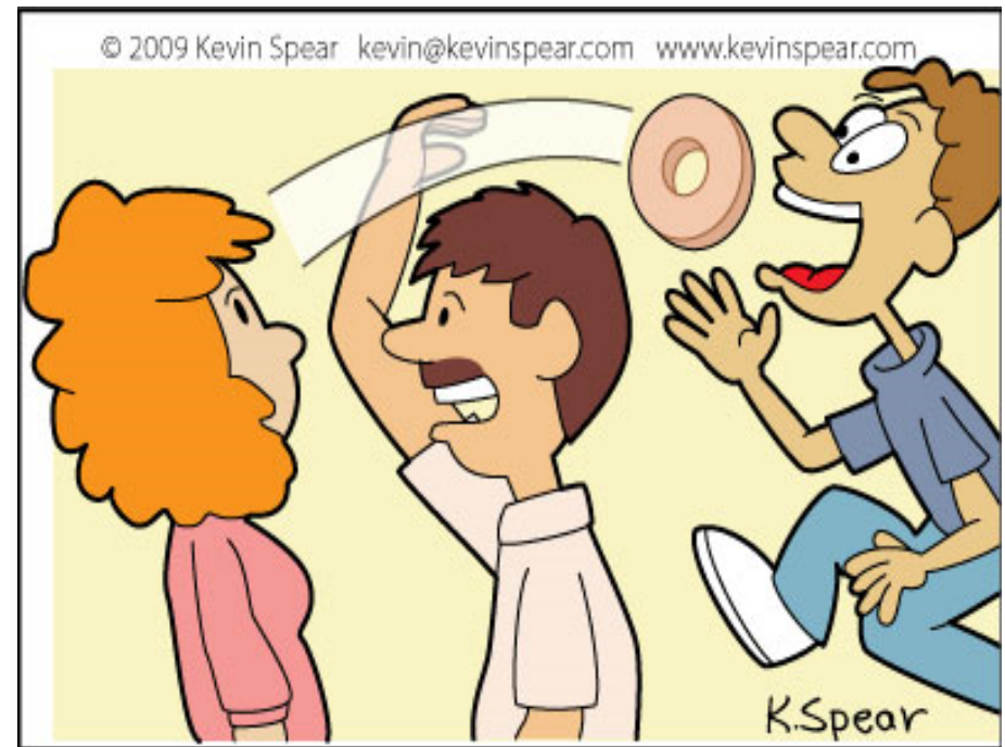
"The youth have been great volunteers. Plus, they work for donuts!"